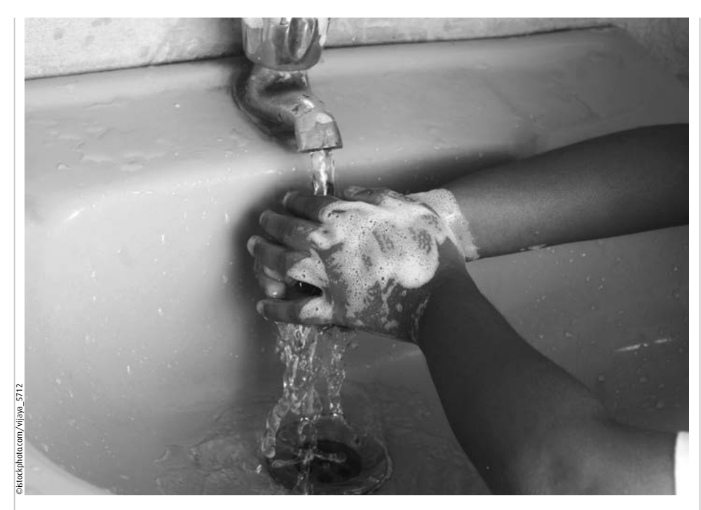
Hand washing checklist saves lives